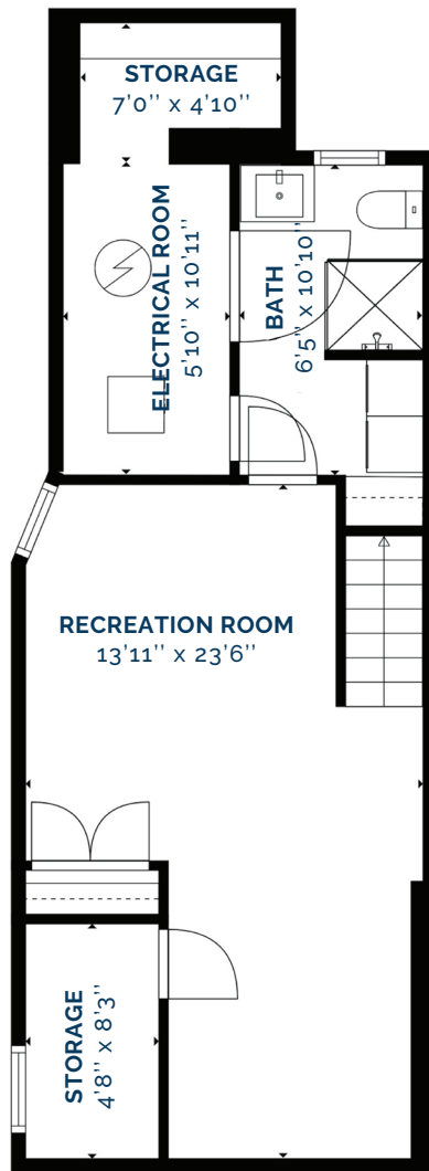
BASEMENT 492 Square Feet